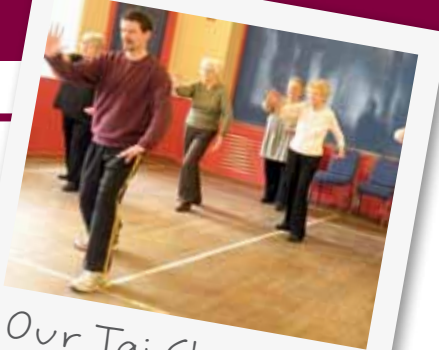
Our Tai Chi class at Bramhope

Dru Yoga is a graceful form of yoga, based on flowing movements and directed breathing. It improves strength and flexibility, creates core stability and gives you a feeling of positivity. It is both relaxing and rejuvenating.