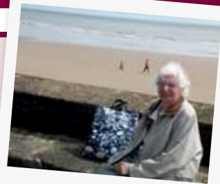
Enjoying the sea air

We enjoyed the beautiful scenery as the coach took us through the Dales to reach our destination. This was followed by a lovely day where we took full advantage of the gorgeous fish and chips. Scrumptious!