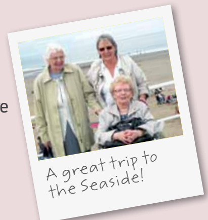
A great trip to the Seaside!