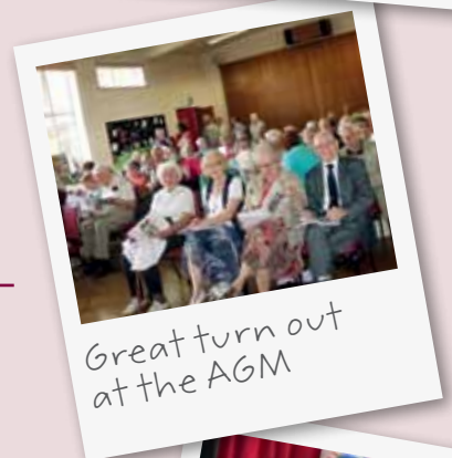
Great turn out at the AGM